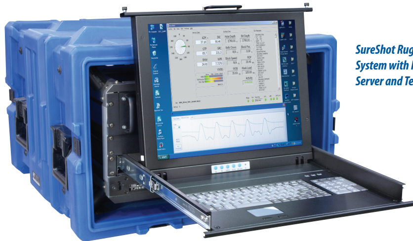
SureShot Ruggedized System with Integrated Server and Terminal