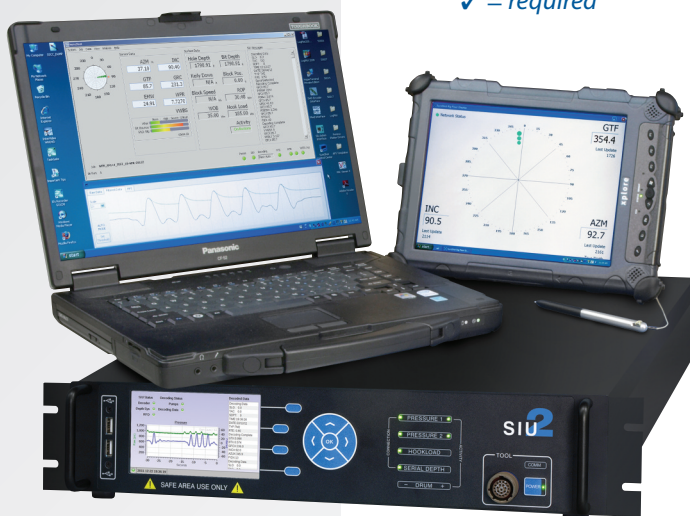
SureShot Lite with DTS, Laptop, Standard Rig Floor Display, Depth Encoder and Hook Load Sensor